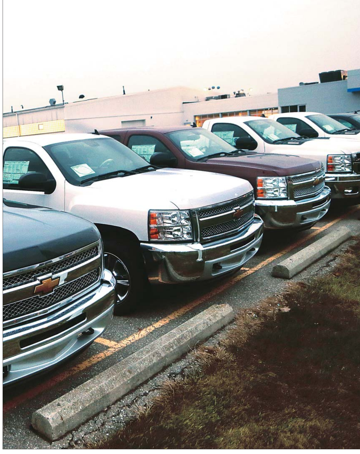
In the left picture, a Toyota concept vehicle is shown at a motor show in Tokyo this year and in the right picture, Chevrolet Silverado pickup trucks are displayed. GM Chevrolet Silverado pickup trucks are displayed. GM Chevrolet Silverado pickup trucks are displayed. percent of the total market. Toyota has also focused its African business on South Africa, and it started operating a local manufacturing plant in Egypt in 2012.